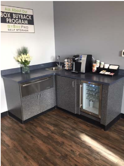
Our always free self-serve coffee bar, cold water, and warm cookies give our tenants some refreshment while visiting the facility.