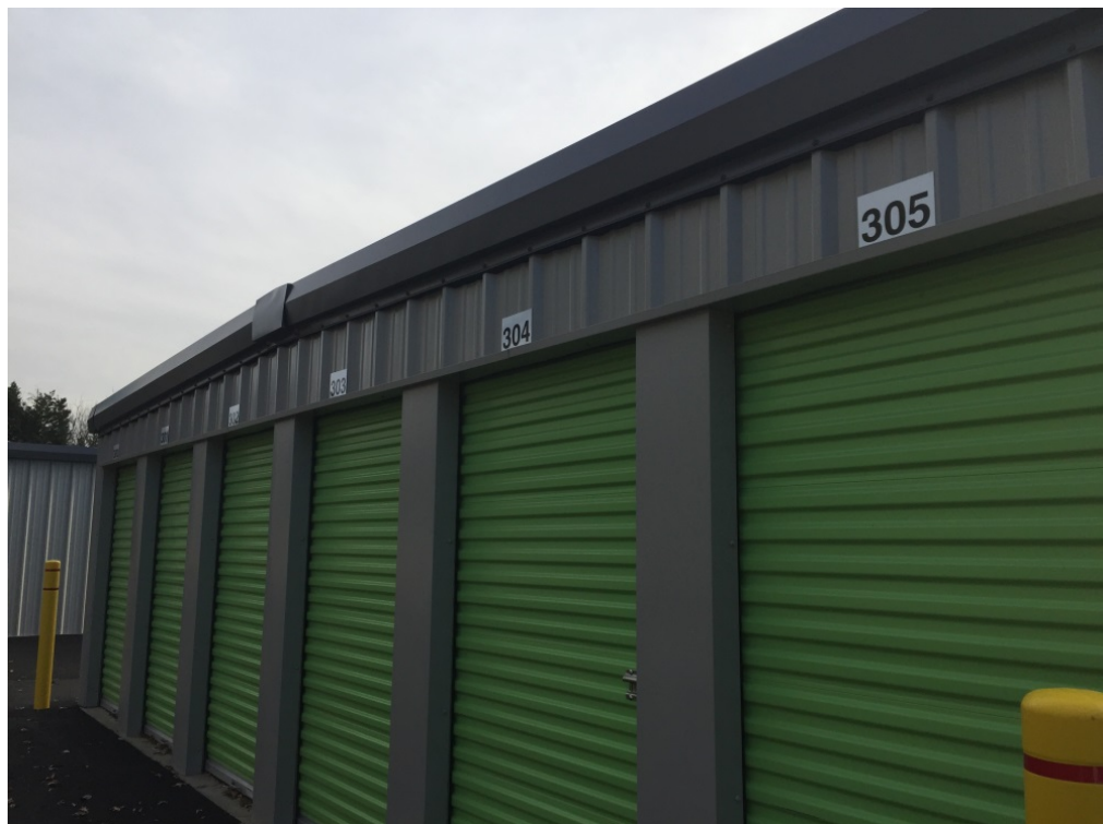
Adding rows of non-climate units in the parking lot of this grocery store conversion was an incredibly profitable decision.