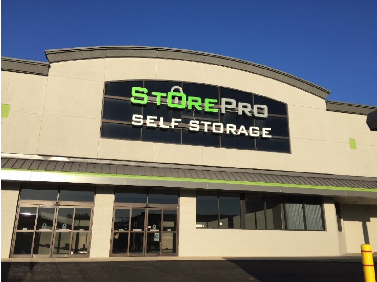
Pops of wasabi green added to the existing stucco and metal trim on the building help create a striking and brand-reinforcing façade.