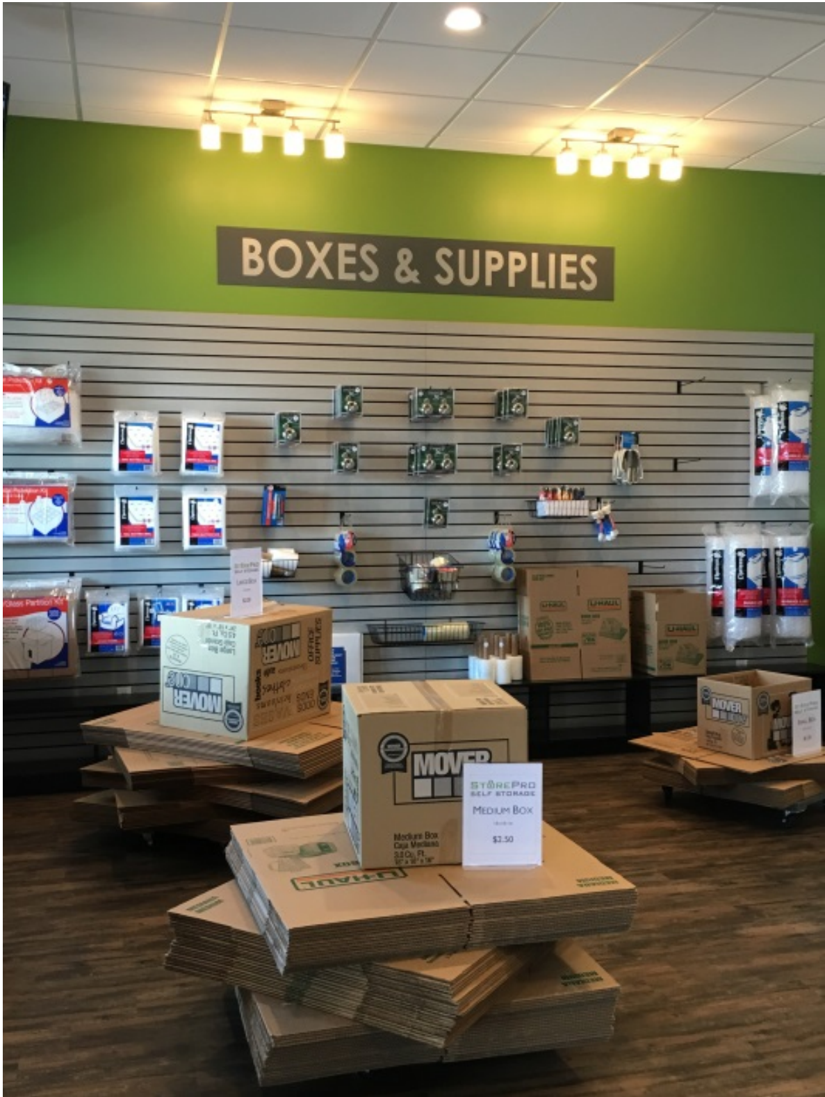
Our full line of boxes and supplies are well-stocked at all times, and our knowledgeable managers are ready to advise and assist their needs.