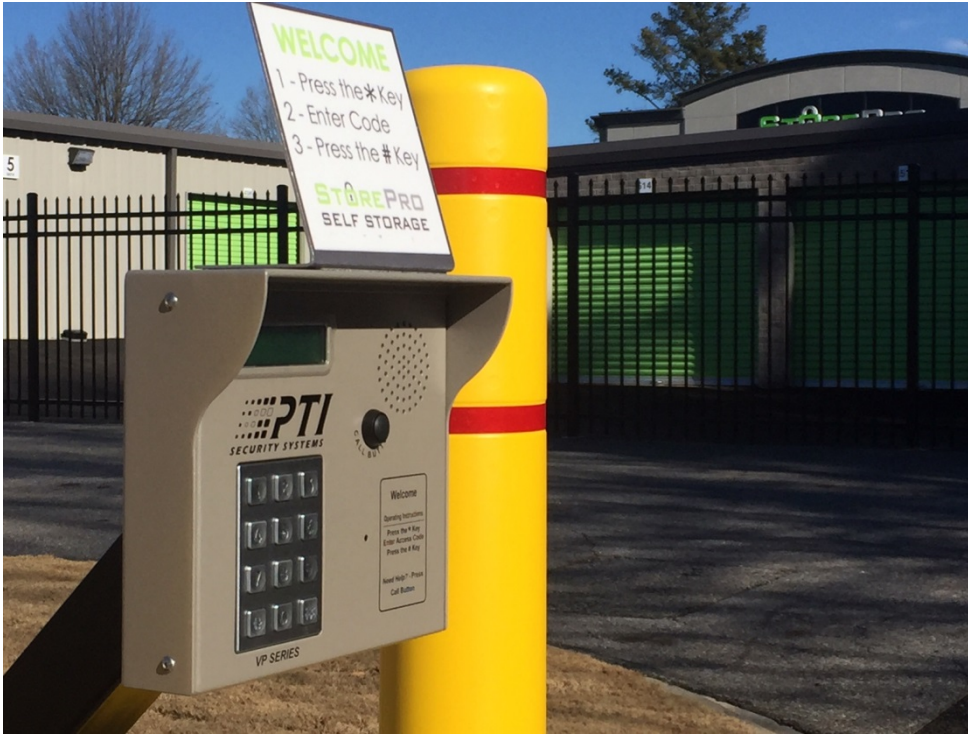
State of the art technology is a great selling feature at this college friendly town.